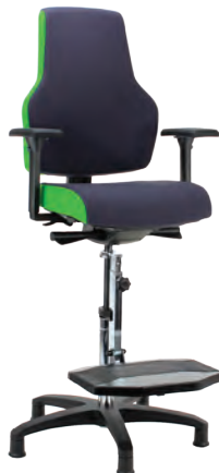
Score At Work Bicolor L*