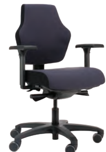
Score At Work Bicolor*