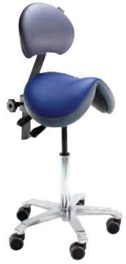
Jumper saddle chair with backrest