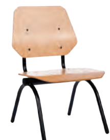
MaXXLine waiting room chair