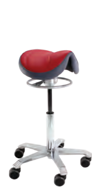
Amazon saddle chair with balance mechanism