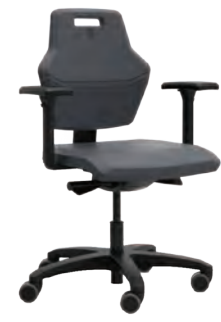
Score At Work PU*