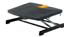
Footrest Pro 959

*The entire Score At Work line is modular and multi-purpose. Seat and back come in different sizes