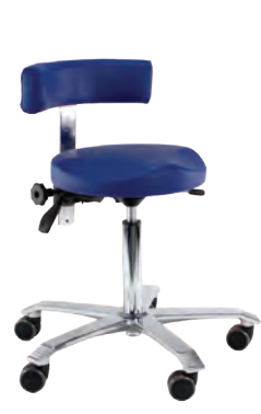
Medical 6331 with ergonomically shaped seat (recessed edge)