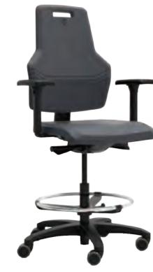
Score At Work PU L*