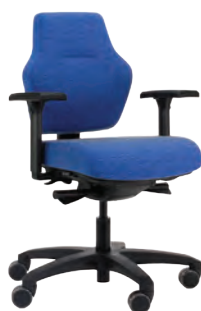
Score At Work Blend*