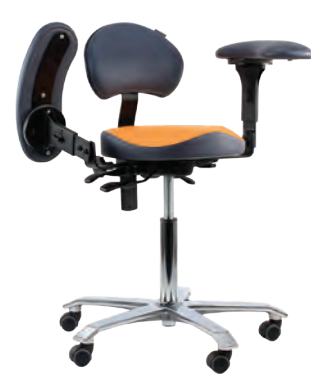
Medical swing support special