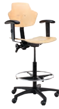
Spirit 1502 Beech