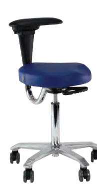
Medical 6305 (Nurse) with revolving armrest